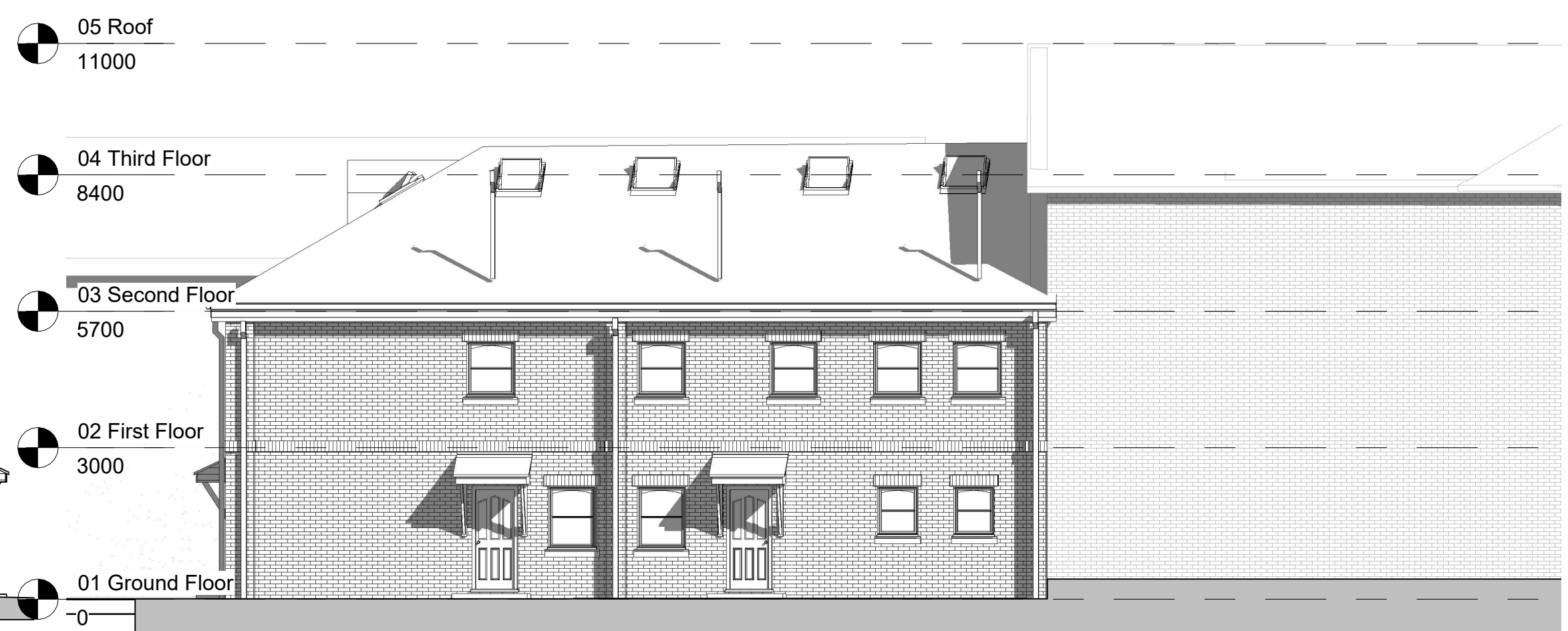
Side Elevation 2 1 : 100