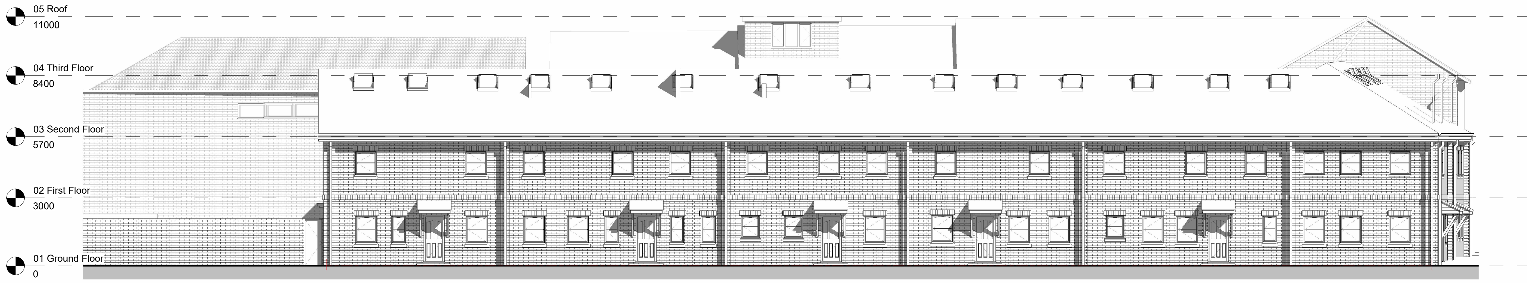
Front Elevation 1 : 100