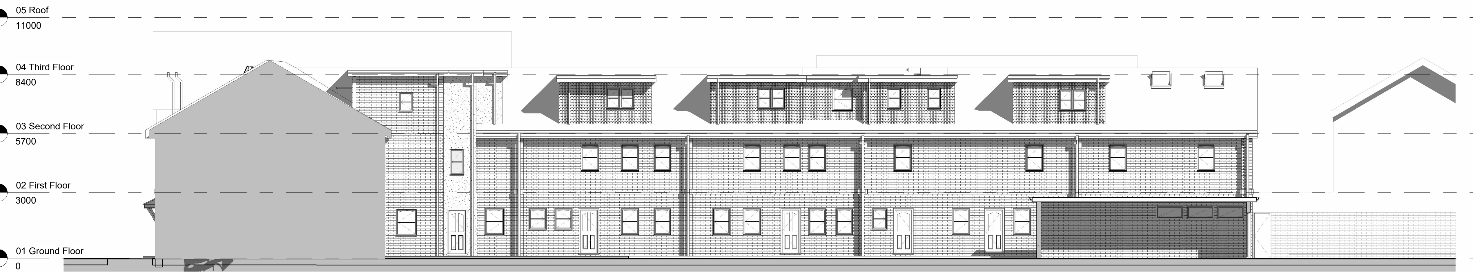
Rear Elevation 1 : 100