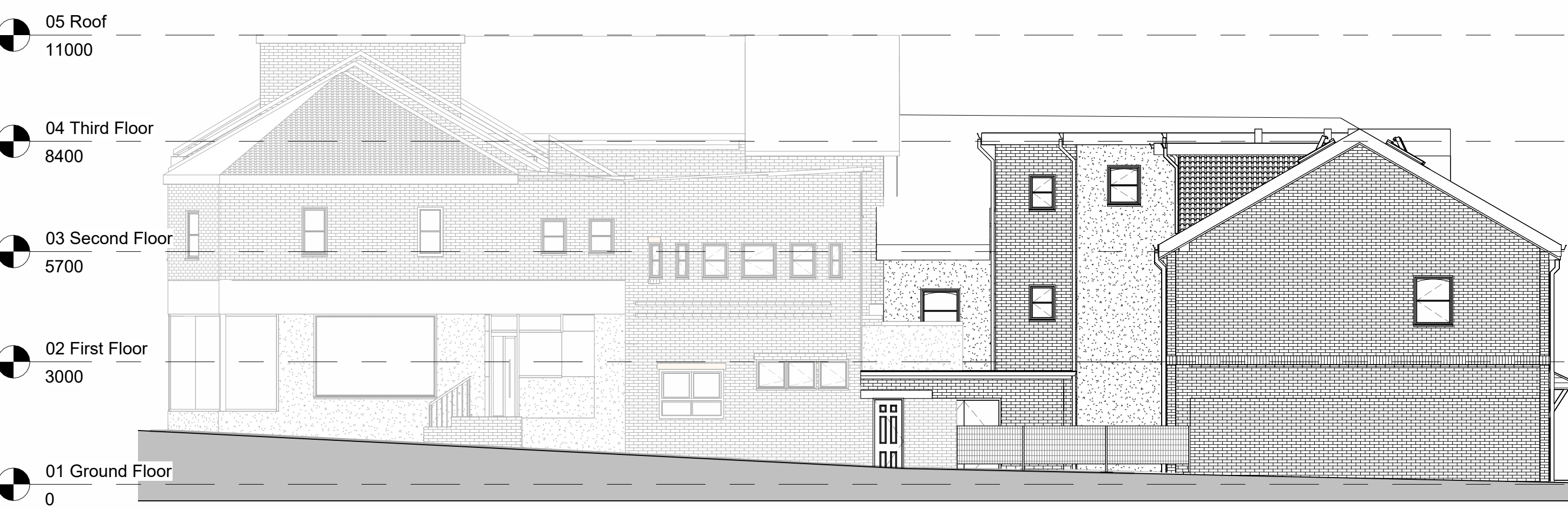
Side Elevation 1 1 : 100